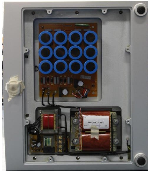
Left: Bottom "hull" as seen from the top (note Yves-Bernard's signature of QC approval)